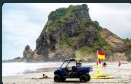
SWIM BETWEEN THE FLAGS