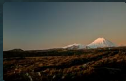
KNOW YOUR NATURAL HAZARDS