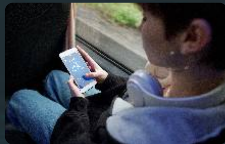
CHECK THE WEATHER FORECAST