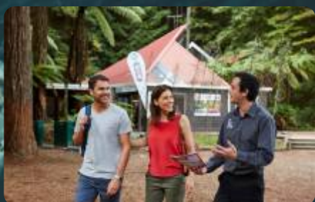
CHECK OUT A VISITOR CENTRE