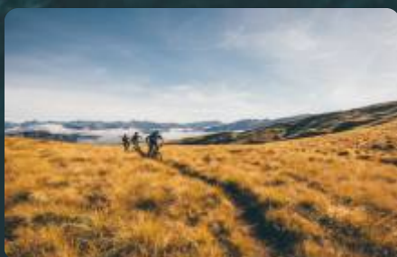
FOLLOW THE LAND SAFETY CODE