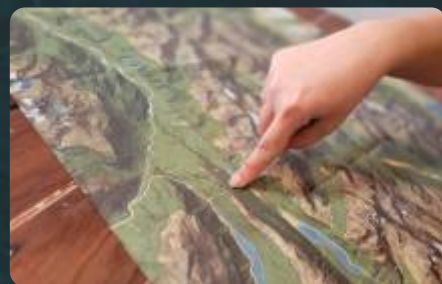
SHARE YOUR PLANS