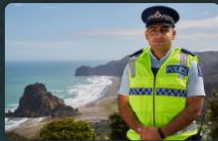
DIAL 111 IN AN EMERGENCY