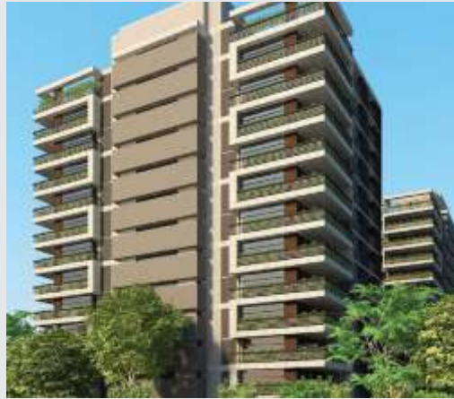
Paarijat Residency, Bodakdev Ahmedabad