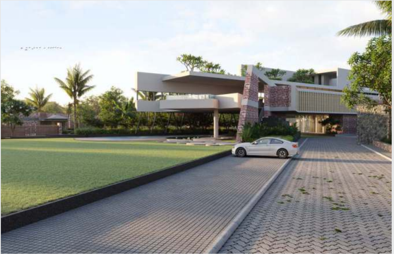
AAM BAGAN, JESANGURA