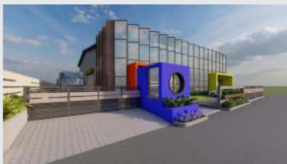
ALUWIN SOLUTION, Changoder, Ahmedabad