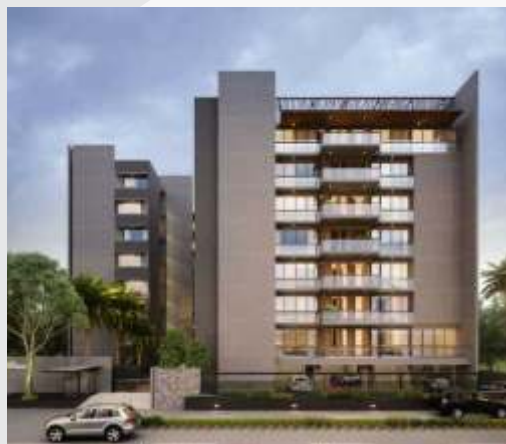
Marquis, Bodakdev - Ahmedabad