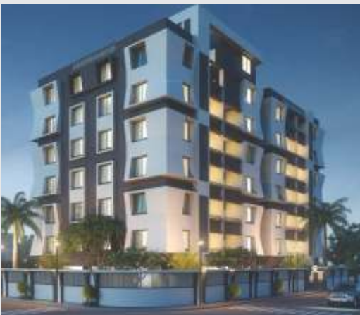
Opal Residency, Navrangpura Ahmedabad