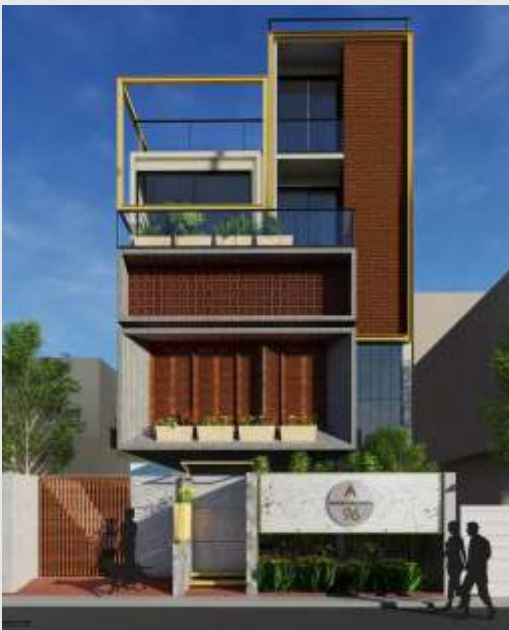
Umeshbhai kanjariya (Bungalow), Baroda