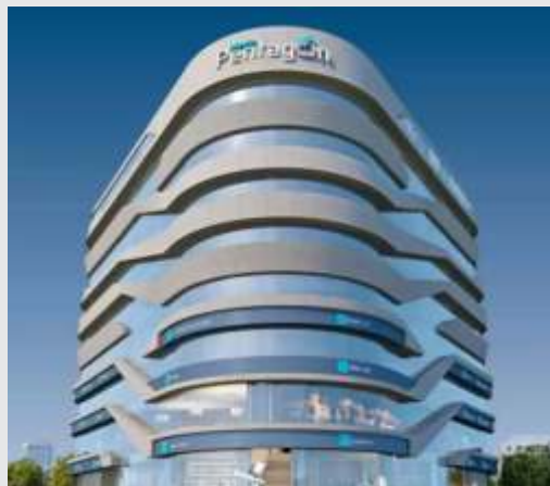
Pentagone, Paldi - Ahmedabad