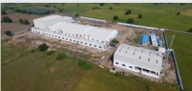
Uma Converter Unit - 2

This projects only Extension in this unit like parking, dispatch, scrap yard, boiler shed.