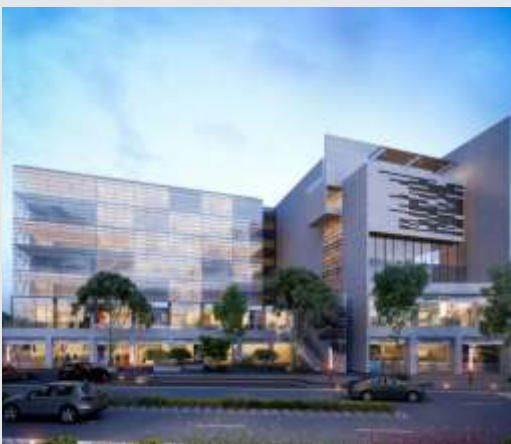
Westface, Hebatpur - Ahmedabad