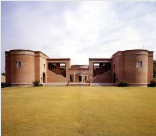
EDI Campus, Bhat - Ahmedabad